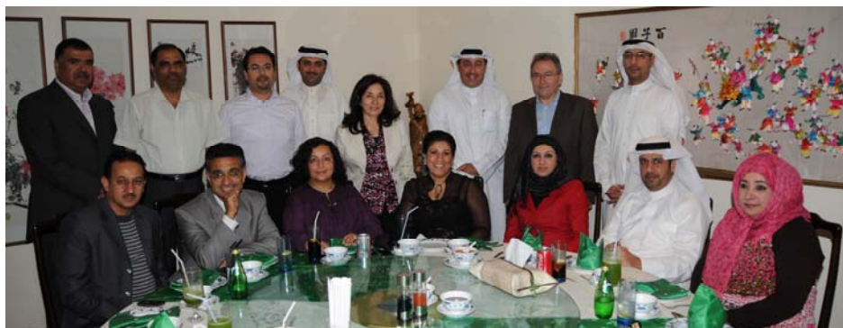
Bank's management team in a social gathering in the Chinese restaurant, Hong Kong